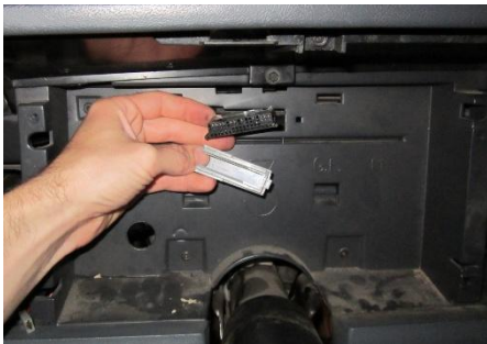
Remove Connector Clip