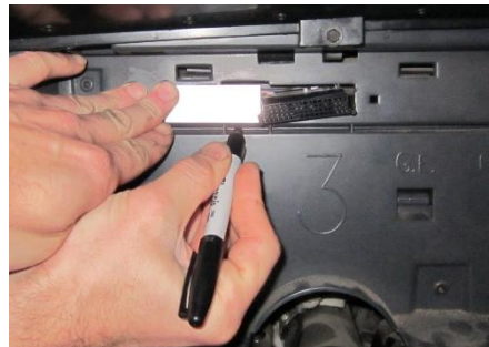
Outline Cutting Template