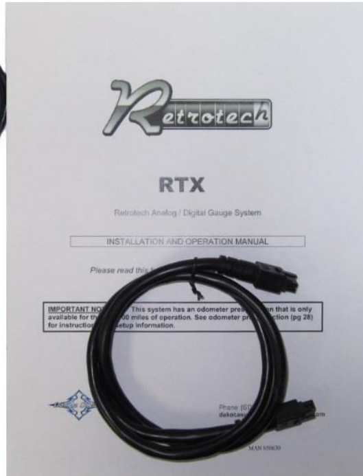
36" Main Harness