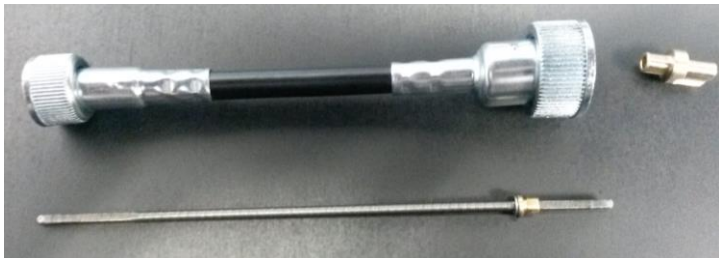
Inner cable flipped 180