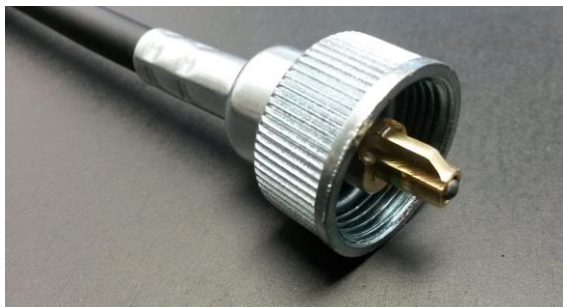
7/8" thread-end of cable assembled with brass tang