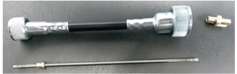
Inner cable removed