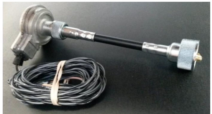
Sensor threaded on to cable assembly, ready for installation