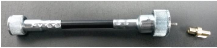
Cable and tang, as delivered