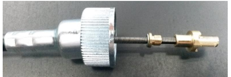
Cable inserted, brass tang in place