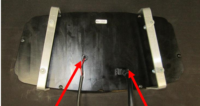
Buzzer Connector Main Harness