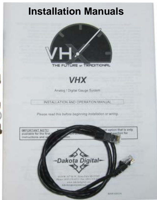
36" CAT5 Cable