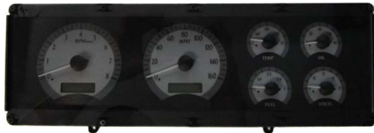
Universal Sender Pack