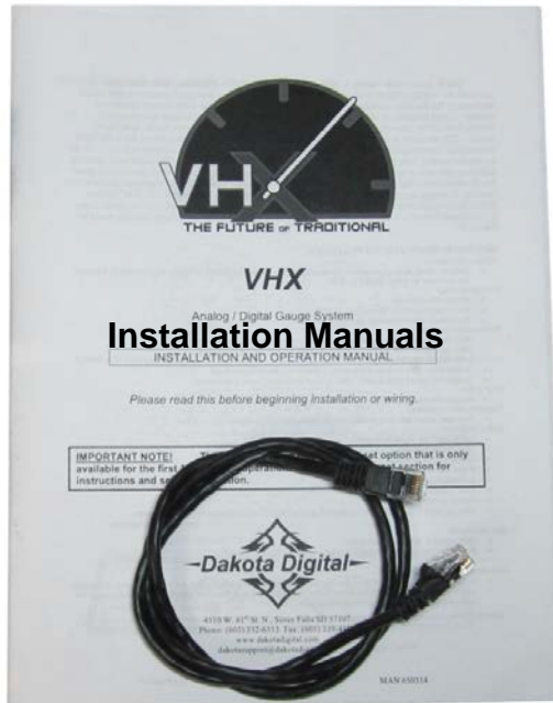
36" CAT5 Cable