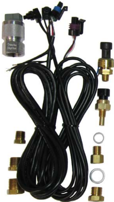
Universal Sender Pack