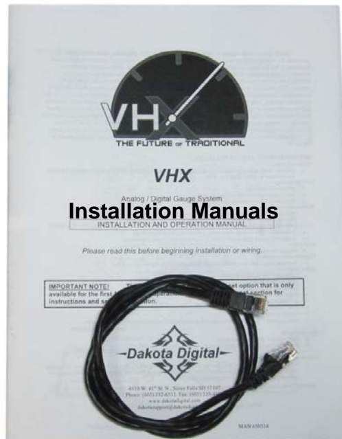
36" CAT5 Cable