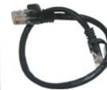
12" CAT5 Cable