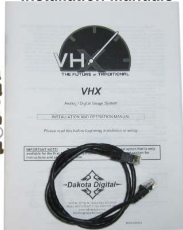
36" CAT5 Cable