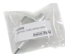
Ford Speed Adapter