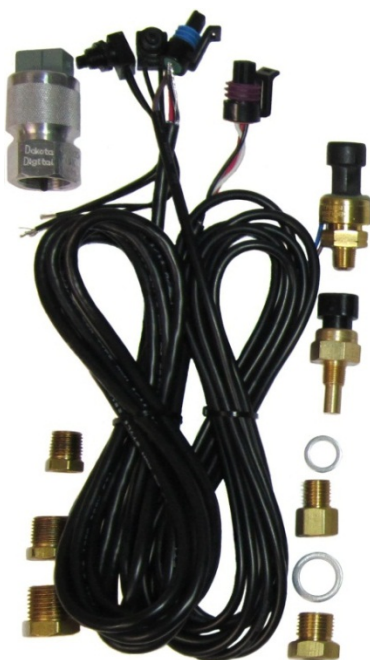
Universal Sender Pack