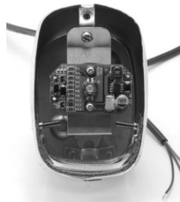
LED assembly mounted in a reproduction housing.