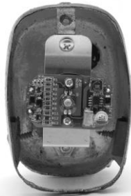
LED assembly mounted in an original housing.