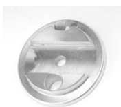
Back plate removed (attached to the assembly)