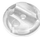
Back plate for '75-'76 Caprice (packaged separately)